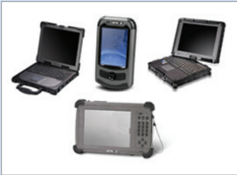
Any PC can be used for running the software (Not included in the package)